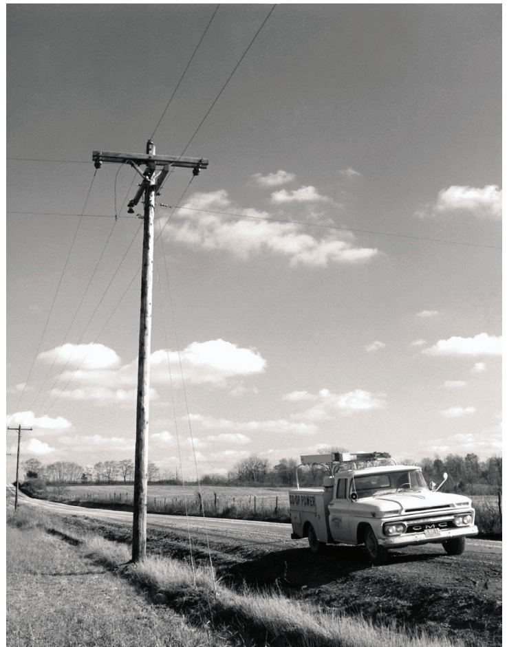
Logan County Electric Cooperative truck.