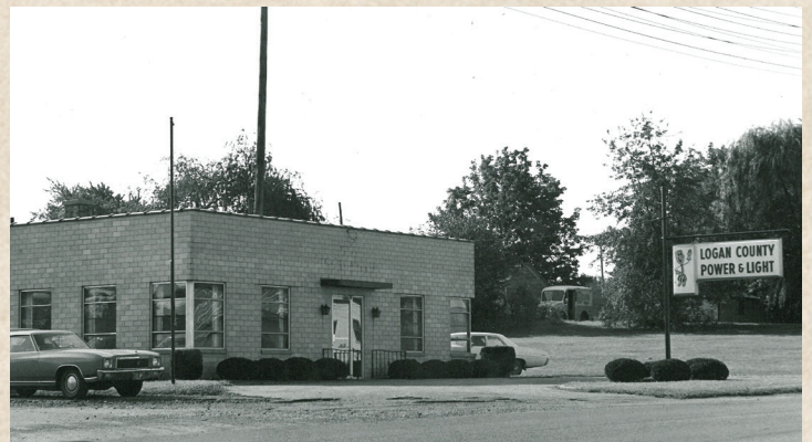
Logan County Power & Light was located at 1015 S. Detroit St. in Bellefontaine until 1985.