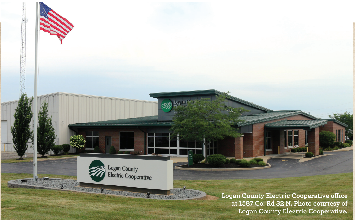
Logan County Electric Cooperative office at 1587 Co. Rd 32 N.

Following community meetings, local residents formed the Logan County Cooperative Power & Light Association