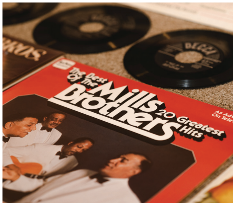
The Mills Brothers were born in Piqua, Ohio but moved to Bellefontaine during their teenage years. The Mills Brothers broke racial barriers with their popularity, and their memorable sound still influences musicians today. LoCo Art's 2022 Mills Brothers mural (exterior wall at 209 S. Main St.) is part of the America 250-Ohio's "Murals Across Ohio" program.