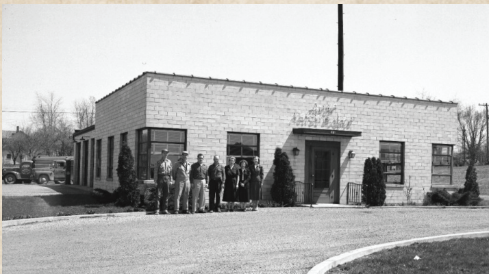
Employees of Logan County Power & Light pictured in the early 1950s.