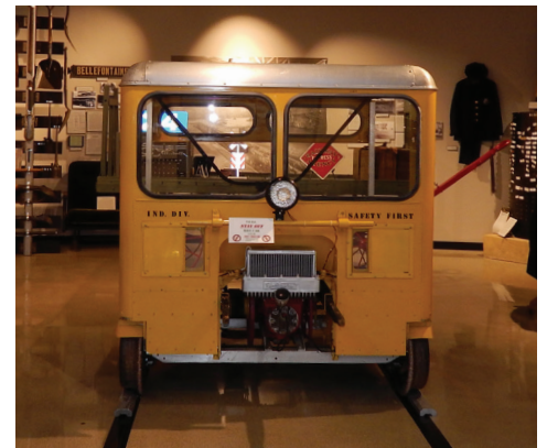
This 1953 battery-powered railroad track car was used in the New York Central Roundhouse railyards in Bellefontaine. The Bellefontaine Roundhouse (first Big Four then New York Central) was one of the largest railroad repair centers in the U.S. and helped make Bellefontaine an important railroad town from the 1890s to the 1960s. The Logan County Transportation Museum was chosen to be part of the America 250-Ohio Commission's "Transportation Trail."