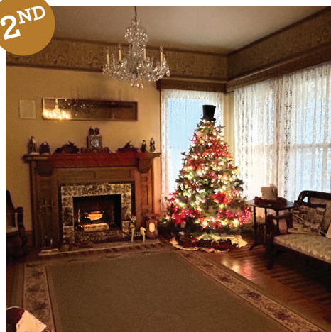
East Parlor – Decorated by the Logan County Libraries