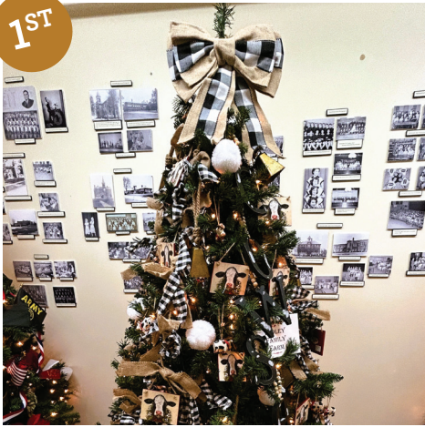
Ledley Family Farm