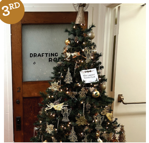
West Liberty Garden Club