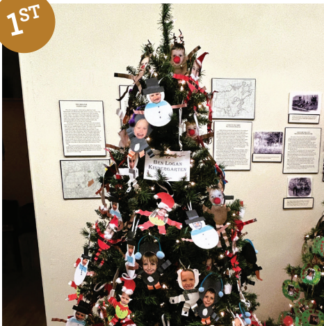
Ben Logan Kindergarten