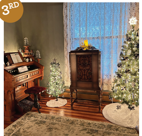
Music Room – Decorated by the Logan Piecemakers