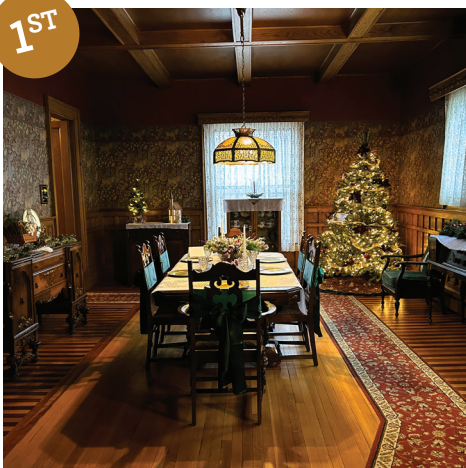
Dining Room – Decorated by the Logan County DAR