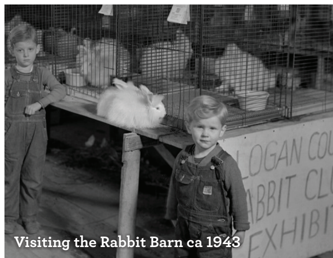
Visiting the Rabbit Barn ca 1943