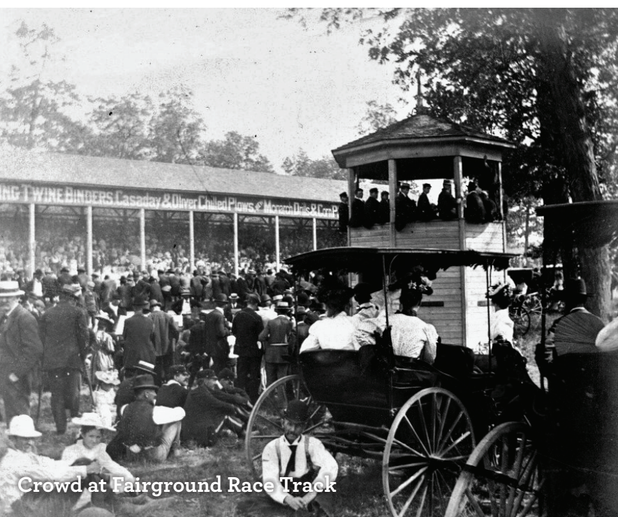
Crowd at Fairground Race Track