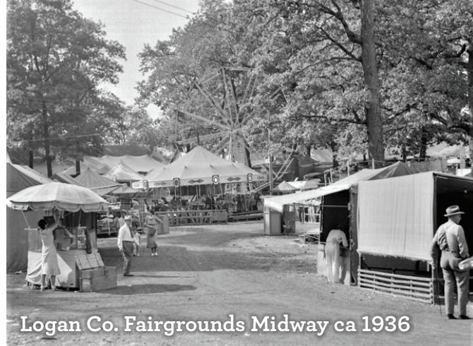
Logan Co. Fairgrounds Midway ca 1936

The Logan County Agricultural Society was founded in 1850, and the first fair was held in downtown Bellefontaine. In 1860, land was purchased at the present fairgrounds site. Exhibitors and fair goers continue to enjoy the Logan County Fair each year.