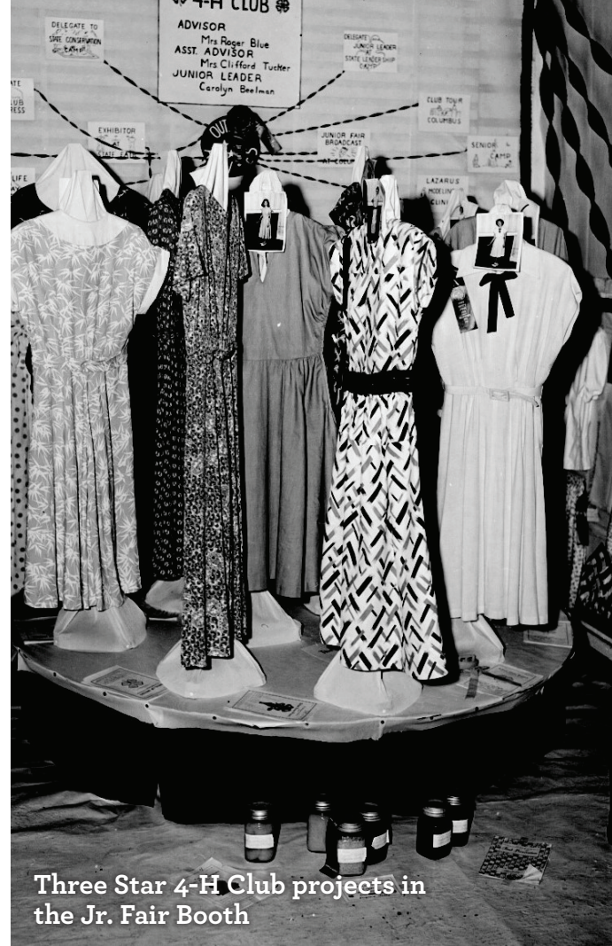
Three Star 4-H Club projects in the Jr. Fair Booth