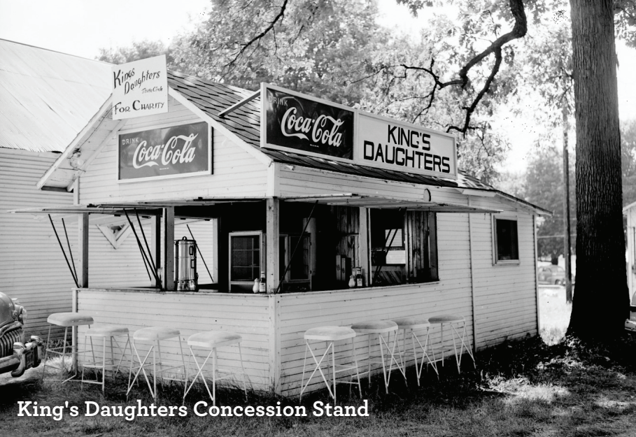
King's Daughters Concession Stand