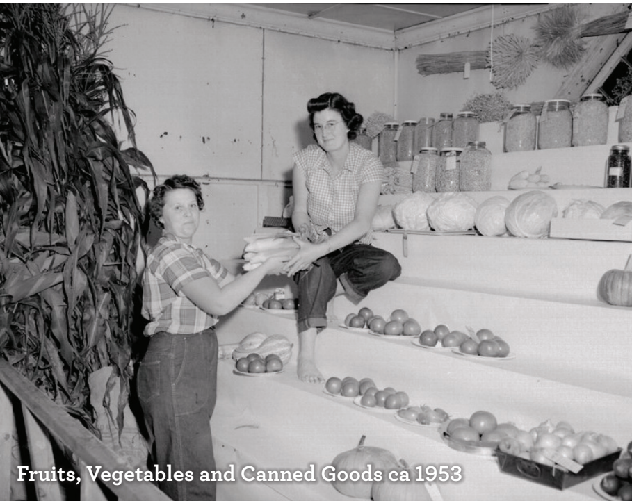
Fruits, Vegetables and Canned Goods ca 1953