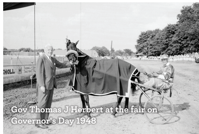
Gov Thomas J Herbert at the fair on Governor's Day 1948