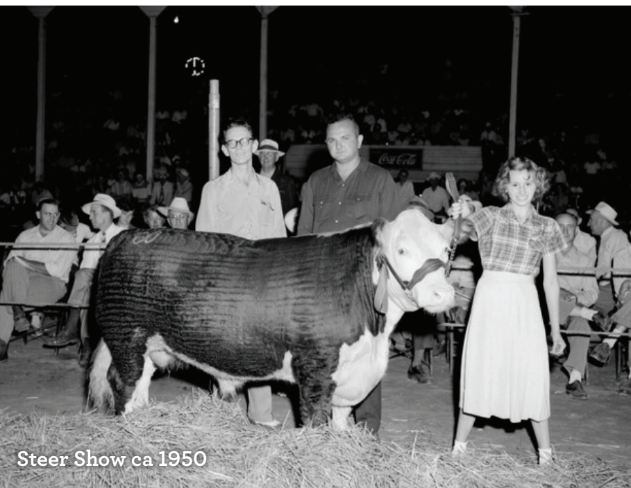
Steer Show ca 1950