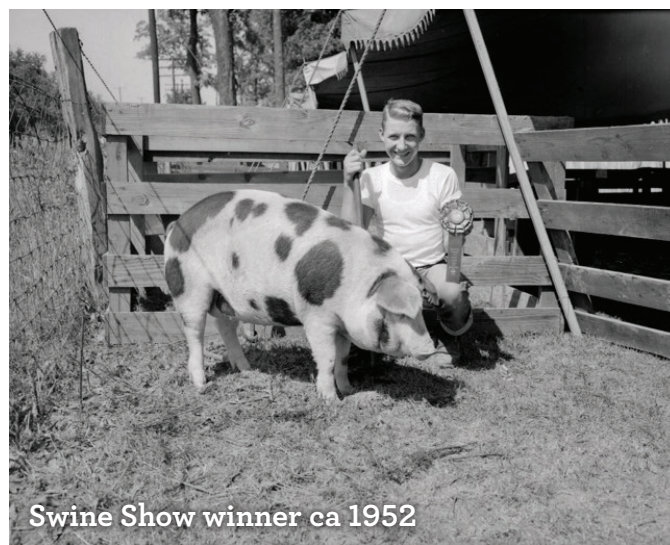
Swine Show winner ca 1952