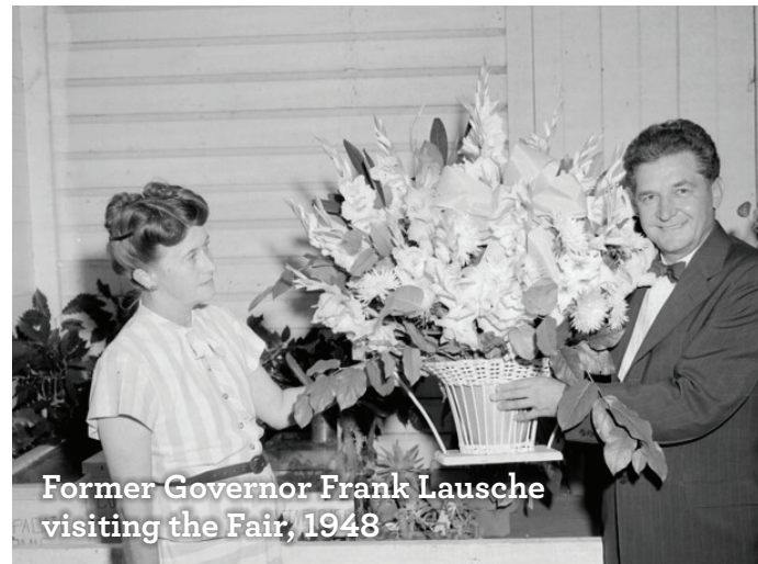
Former Governor Frank Lausche visiting the Fair, 1948