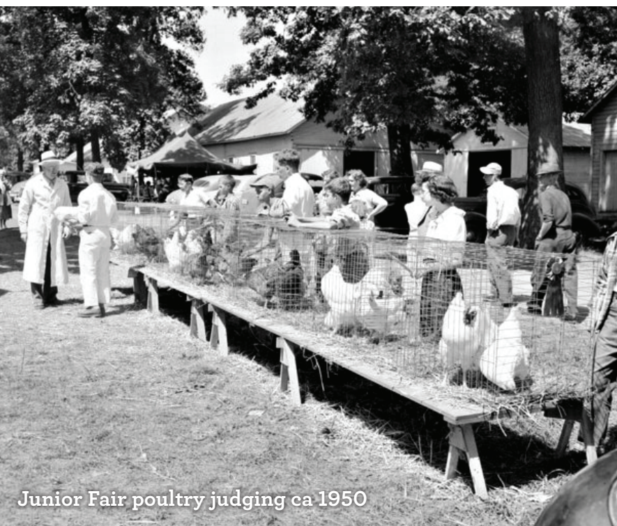
Junior Fair poultry judging ca 1950