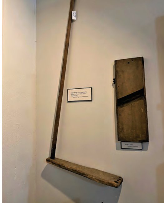
Apple butter stirrer used on the Kaylor & Choice Beck farm at Rushsylvania.

Fall is a great time to get out and enjoy the crisp air and buy apples at your favorite orchard or farmer's market.