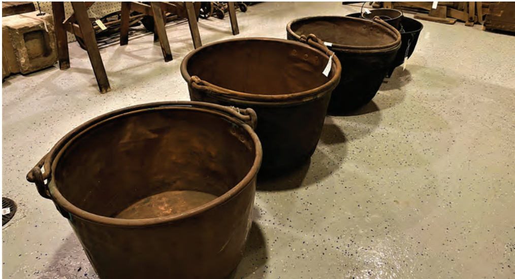
Copper Kettles from the History Center collection