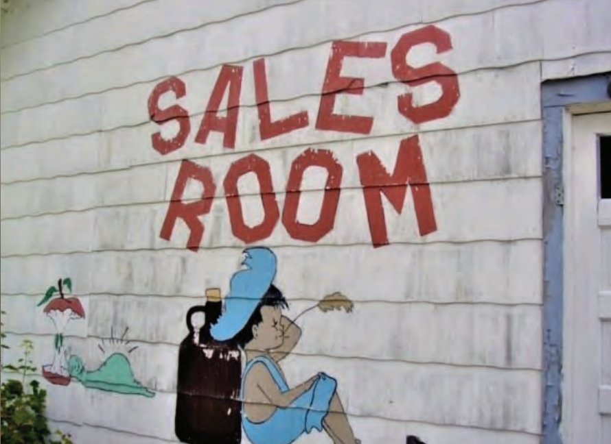
Sales room sign from Brookside Fruit Farm