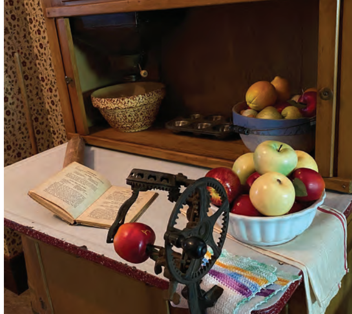
Apple peeler setup in the Orr Mansion Kitchen