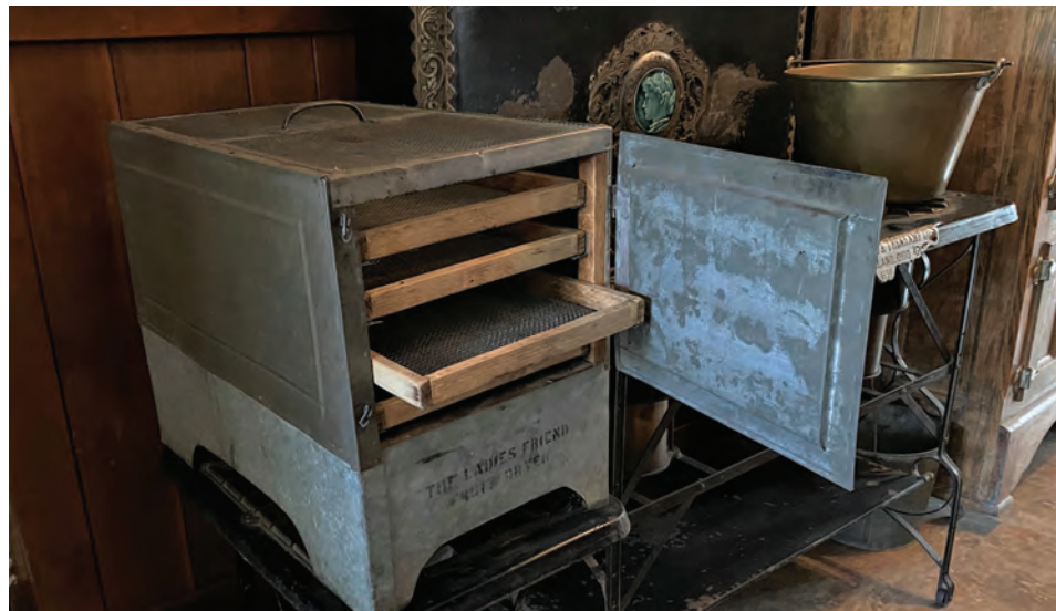
"The Ladies Friend" fruit dryer from the turn of the century in the Orr Mansion Kitchen