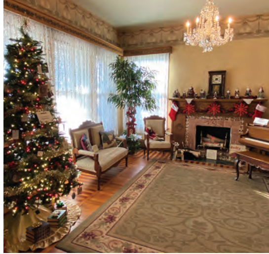
West Parlor decorated by the Logan County Libraries