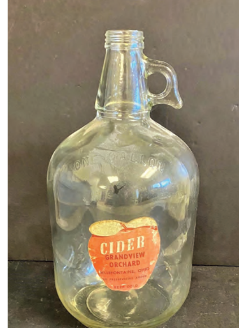
Cider jug from Grandview Orchard