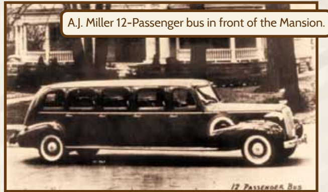
A.J. Miller 12-Passenger bus in front of the Mansion.