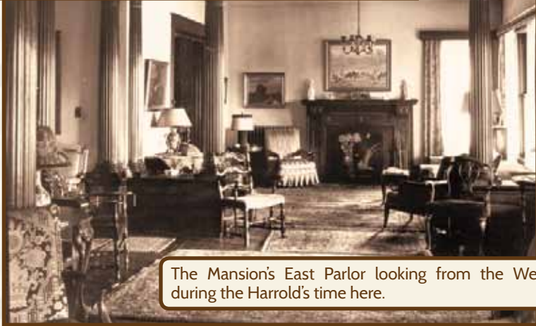
The Mansion's East Parlor looking from the West during the Harrold's time here.