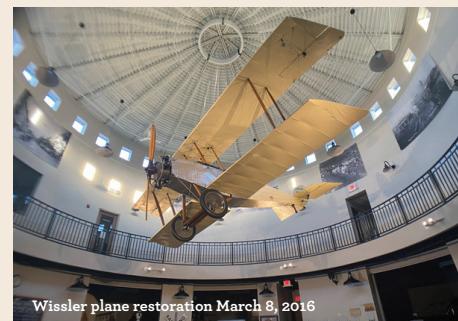
Wissler plane restoration March 8, 2016

FUN, FUNKY AND FASCINATING | APRIL 24 TH 1:00-5:00PM