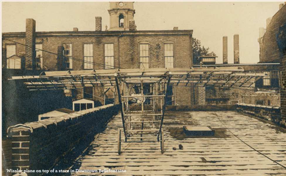
Wissler plane on top of a store in Downtown Bellefontaine

Come read about this creature and other interesting critters at the Fun, Funky, and Fascinating exhibit!