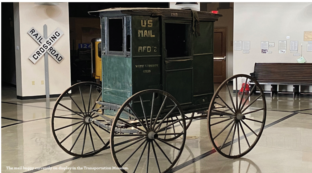
The mail buggy currently on display in the Transportation Museum.