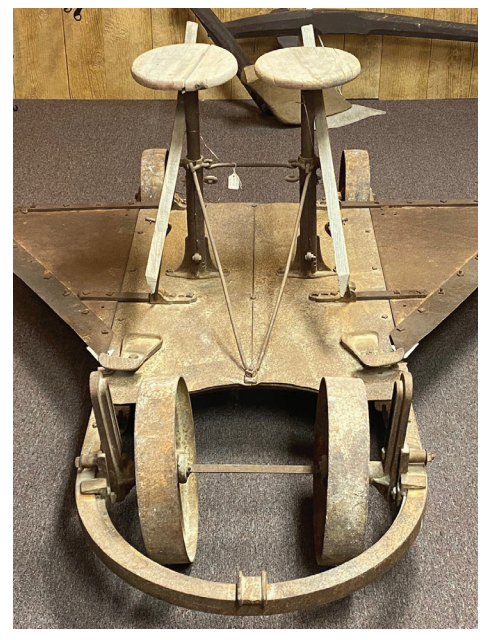
Corn Sled – a farm implement used to cut stalks of corn. The blades dropped down on both sides of this two-seater corn sled to cut the corn stalks as the sled was pulled by horse. Donated by Clem Butts.