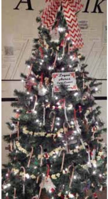
Logan Acres tree