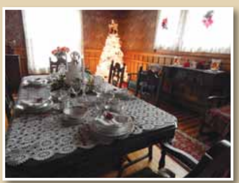
Logan County Genealogical Society tree